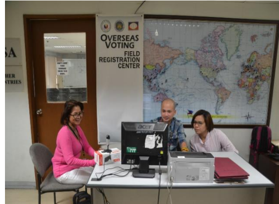
Aside from their registration with CFO, permanent migrants can also exercise their right of suffrage in their respective host countries through CFO's Overseas Voters Registration Center.

In support of the government's extensive campaign in encouraging overseas Filipinos to register and exercise their right to vote during election period, the CFO regularly partners with the Commission on Elections in operating an Overseas Voters Registration Center (OVRC) in CFO Manila. The CFO-OVRC is located at the 2/F of the CFO building where the PDOS sessions are conducted. It started operations in February 2017 until September 2018.